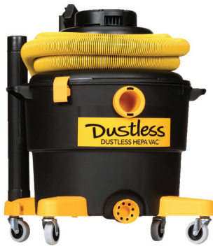
HEPA Wet+Dry DustlessVac® (D1606)