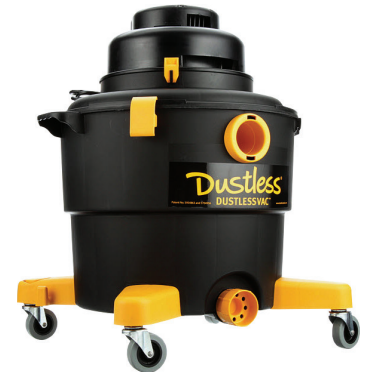
Wet+Dry DustlessVac® (D1603)

*For general jobsite clean-up and vacuuming drill holes, a HEPA vacuum is required.