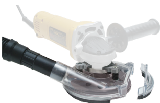
DustBuddie® for Grinding (D1835/D1850)

A commercially available dust collection shroud attached to the worker's tool.