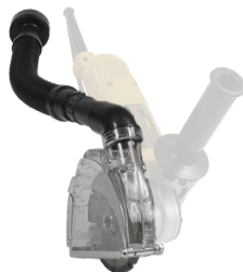
CutBuddie® for Cutting (D1730/D1750)