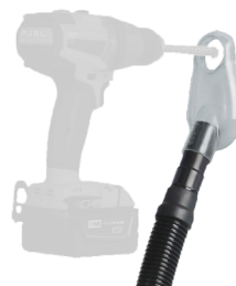
BitBuddie® for Drilling (D1900/D1905/D1908)