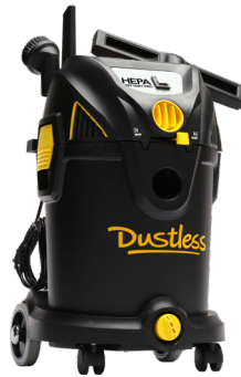
HEPA Wet+Dry PRO DustlessVac® (D1619)